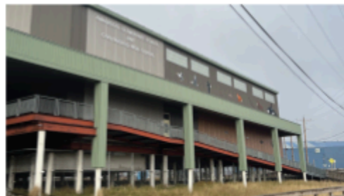
Amaqigciq Elementary and Chaputnguak High School in Chefnak.