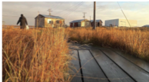
Getting around the village on the boardwalk.