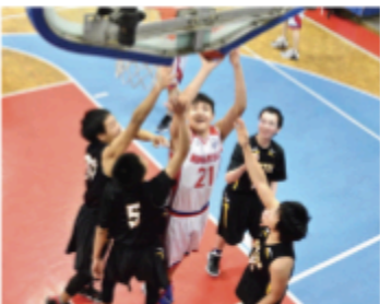
Basketball is extremely popular in LKSD schools and communities.